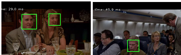
Figure 1: Examples of success and failure of the face detector in movie frames.

is to estimate the total time during which at least one female actor is present on screen, and the same when at least one male actor appears on screen. An obvious step is to detect and track all faces that appear on screen. However, popular face detectors, such as the Viola-Jones face detector [13], can reliably detect faces under limited conditions (e.g. frontal poses). Employing multipose face detectors [7] may increase accuracy, but they are not as efficient. Frame-to-frame tracking of multiple faces for long duration is also computationally expensive.