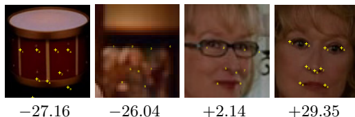
Figure 2: Examples of confidence score for localizing landmark points on false and true faces.

3) False positives removal: Despite the high reliability of the face detector, false faces are detected. To remove false faces, a facial landmark point detection method [1] is used to localize 9 landmark points on eyes, nose and mouth corners (see Fig. 2) on each face. Originally developed for capturing mouth movement, this method returns a confidence score ( c_v ) as a measure of reliability of the localization. The idea is that in true faces, the landmark points will be localized